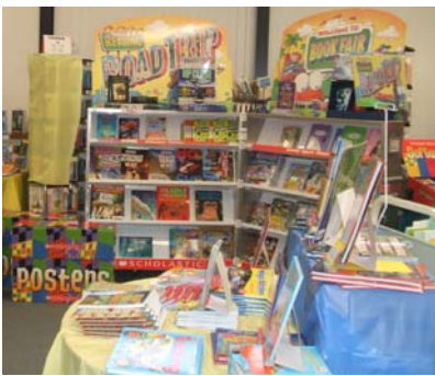
A few of the many interesting books at the annual Book Fair.

During Catholic School's Week, the library is hosted a fundraiser called the Scholastic Book Fair. They have books from Preschool to adult, such as Skippy Jon Jones and Harry Potter and the Deathly Hallows . The books price range is between $3.99-$34.99. There was also a large variety of posters, school supplies, electronics, crafts, and software if you are not a big reader but still wanted to contribute to the book fair. The Book Fair started Sunday and ended on Wednesday. There was a special appearance by Clifford the Big Red Dog on Sunday and Wednesday. We hope you enjoyed the book fair and spend a lot of time reading this year!