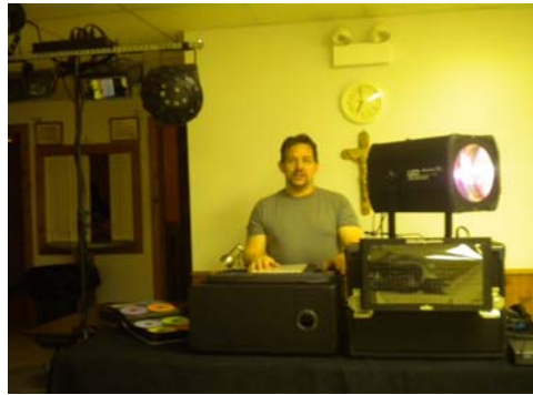
The D.J. for the evening preparing for the night ahead of him.

On Friday February fourth in the Old Church basement the 7th and 8th graders gathered for this year's second dance. Being so close to Valentines day, the dances theme was a valentines dance! For the first time, there was a raffle where students purchased tickets and entered to win either a basket filled with goodies, or a bear. There were two seventh grade winners, and two eighth grade winners. Besides the raffle, we did the limbo until there was one boy and girl left. We also collected many canned food items, which every student had to bring to get into the dance. Overall the dance was a success. Everyone that went to the dance had a fun time with their friends. If you couldn't make it to this dance, you should definitely come to the next one on Friday April 16th. Be there or be square!