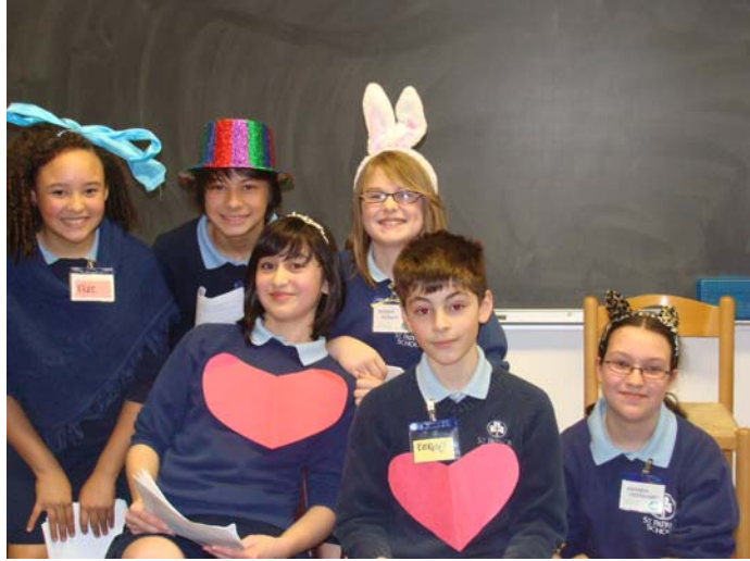
The 6S cast of Alice's Adventure's In Wonderland smiles proudly after their performance.