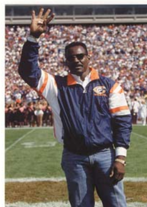
WALTER PAYTON 1954 - 1999

Walter Payton was thought to be the greatest running back of all time. His family has recently opened a liver cancer wing at the University of Illinois Medical Center. They did this because, unfortunately, Payton died of liver cancer in November of 1999. Walter "Sweetness" Payton was MVP twice and broke Jim Brown's rushing record of 12,372 rushing yards. He was NFL Player of the Year twice and helped the Bears, his one true team, get to the super bowl in 1985.