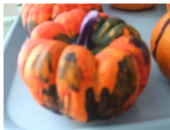
The first graders have recently painted pumpkins for Halloween.

In third grade, students are practicing their multiplication tables...which, as we know, are the building blocks for higher math. Good luck, third grade!