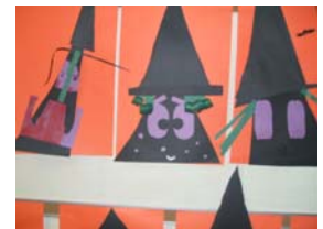
The second graders have decorated the hallways with their Halloween witches!

Finally, the 8 th grade has been writing fantasy stories in English. They just finished reading the Hobbit and did pretty well on the test. The 8 th grade made their Confirmation on November 3 rd , and we are all praying for them. For more information on their Confirmation, see "Confirmation News."