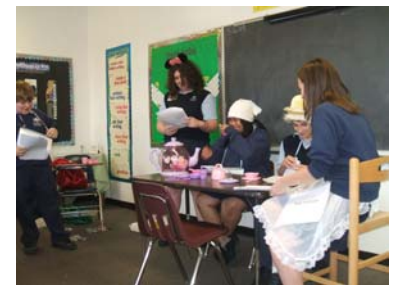
Above, Alice is entertained by her "Wonderland" friends.