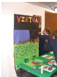
Students transform the rooms: Upper-left is Asian cuisine and flora/fauna, Middle-left is an African hut, Lower-left is a Central American jungle; Just left is a display about Vietnam, Right is a relief map of South America. Students worked for nearly five hours making their classrooms look like a region of the world.