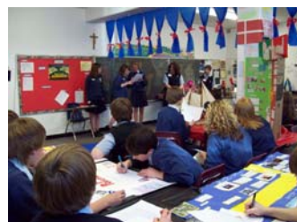
Above and left, students learn about Europe and South America during a presentation / scavenger hunt on Day Two.