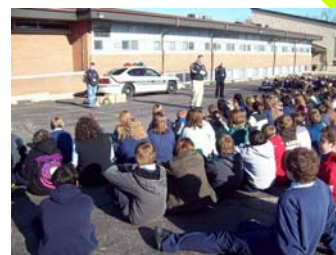
Waukegan officers visit St. Patrick School to demonstrate to students how police dogs are trained.