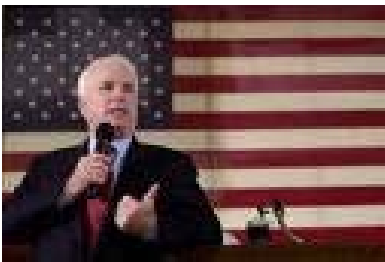
McCain works on his campaign.

This year it has been a very close race between our 3 candidates for president, John McCain, Barack Obama, and Hilary Clinton. With many close calls between Obama and Clinton, Obama is just a tad bit ahead of Clinton. McCain has been the republican candidate since Huckabee drop out of the race. We are yet to find out