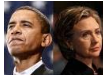
The Democrats continue to battle it out.

who will be representing the democratic side. Either Clinton or Obama would make a big difference in history because if Clinton wins she would be the female president but if Obama wins he would be the first African American president in history. We hope America makes a good decision for our country's next president.