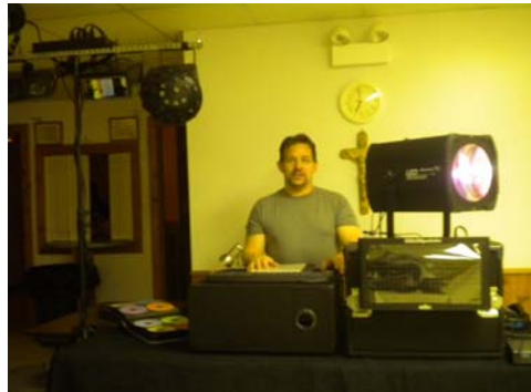
The D.J. for the evening preparing for the night ahead of him.

On Friday February fourth in the Old Church basement the 7th and 8th graders gathered for this year's second dance. Being so close to Valentines day, the dances theme was a valentines dance! For the first time, there was a raffle where students purchased tickets and entered to win either a basket filled with goodies, or a bear. There were two seventh grade winners, and two eighth grade winners. Besides the raffle, we did the limbo until there was one boy and girl left. We also collected many canned food items, which every student had to bring to get into the dance. Overall the dance was a success. Everyone that went to the dance had a fun time with their friends. If you couldn't make it to this dance, you should definitely come to the next one on Friday April 16th. Be there or be square!