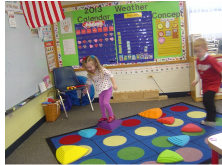
Preschoolers jumping for joy on Saint Valentine's Day!