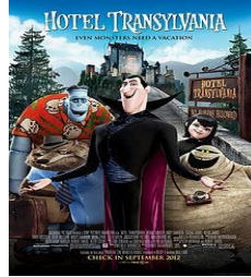
Movie's Release Image

Hotel Transylvania was a fun movie thanks to its colorful array of voice, actors, and actresses and a lively plot, setting a new record for the highest-grossing, September opening weekend. It is a family movie, not generally directed towards middle school students or high school students, who may find the movie boring. The movie is buoyant and giddy enough to please younger audiences, but it may be a bit too loud and thinly-scripted for older audiences. So gather your kids and check in for fun!