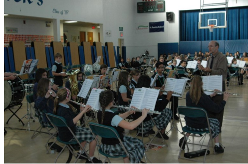
The Intermediate Band performing at the afternoon recital.

This field trip was not the best, but was still fun overall. I think some of the less-sporty students would have had more fun with something else, but they should have still somewhat enjoyed it because of the excitement at the beginning of the game. Overall, the first trimester field trip was quite fun for many junior high students!