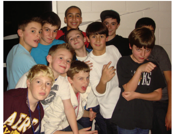
Seventh Grade boys pose while they are having fun during the first dance of the year.

At the end of the dance the students said their goodbyes to one another and to the teachers. They were all happy and worn out from dancing with each other and had made new memories.