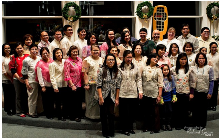
The members of the Filipino choir sang very well during the mass.