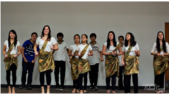
One of the entertainments was a dancing with candles preformed by teenage fillipinos.