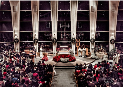
The traditionally decorated church was filled with many people.