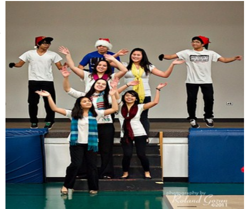
The teens also preformed a Christmas dance to entertain others while they were eating.