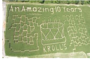
The Kroll's Maze

Inside the barn are tables, pizza, candy, and couches in the back if you are feeling lazy. The hayride is very slow and relaxing, and is fun for young children. It gives you a tour all the way around the farm. All activities at Kroll's Farm were included in the price of the Fall Fest ticket. Glow sticks, pumpkins, and other autumn decorations were available to purchase separately. If you want to get one or more glow sticks, they are available at the entrance of the corn maze.