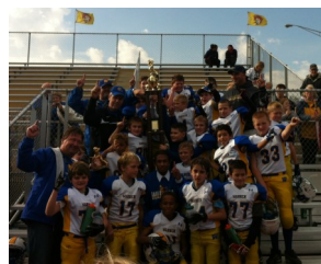
The winning team with the "Super-Bowl" trophy!