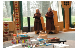
Little Sisters of the Poor