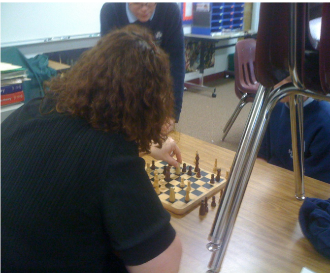
Above, students learn the strategies of chess.

I think that the Food Service Professionals have changed for the better. After all, they are kid-tested and kid approved.